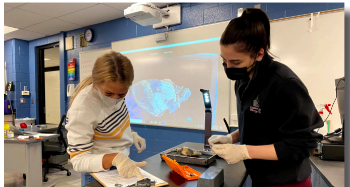
Science Classroom at Haslett High School