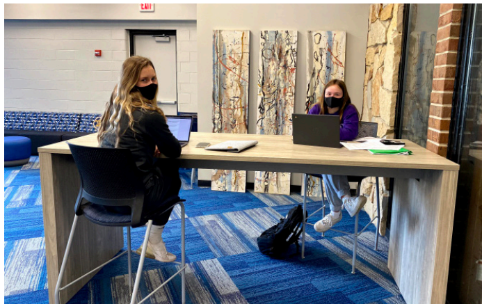
Haslett High School Media Center

Transportation schedules have been revised to accommodate new student schedules, and curbside lunches will continue to be provided for families, as needed.